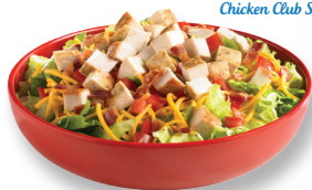
Chicken Club Salad

GRILLED or CRISPY CHICKEN CLUB SALAD Your choice of grilled chicken breast or lightly breaded crispy chicken tenders served on romaine and iceberg lettuce with chopped smoked bacon, fresh diced tomatoes, grated cheddar cheese & choice of dressing.