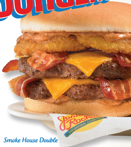
Smoke House Double

SMOKE HOUSE An exceptional blend of flavors, this is a one-of-a-kind hamburger. Smoked bacon, crispy sourdough onion rings, cheddar cheese & our special recipe "Smoke House" barbecue-ranch sauce.