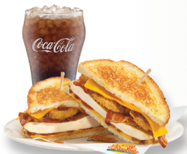
BBQ Chicken Bacon Melt

HOT DOG All-beef hot dog, served with choices of mustard, chopped onions, relish or ketchup.