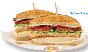
Chicken Club Sandwich